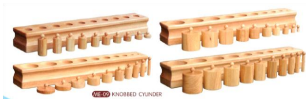
CYLINDRICAL BLOCKS SIZE DISCRIMINATION SET