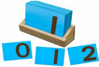
SAND PAPER NUMBERS