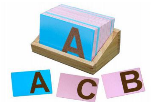
SAND PAPER ALPHABET UPPER CASE