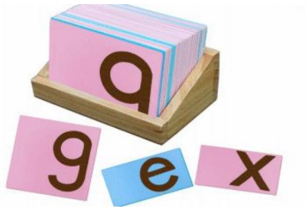
SAND PAPER ALPHABET LOWER CASE