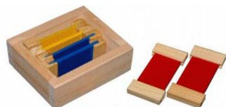
COLOUR TABLETS PAIR OF 3