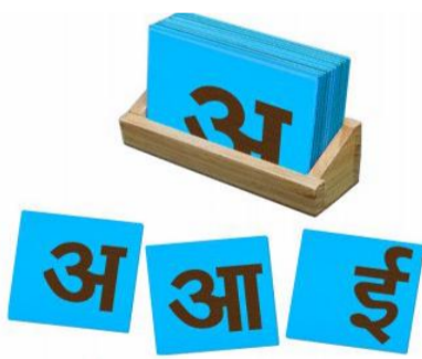
SAND PAPER HINDI - VOWELS