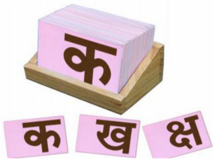
SAND PAPER HINDI CONSONENTS