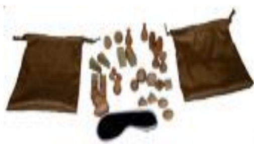
MYSTERY BAGS WITH BLIND FOLD